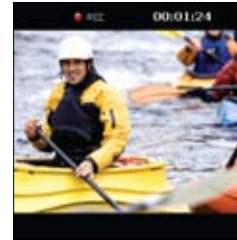
Photos and Videos